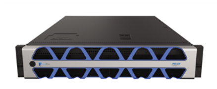
Flex 2 Server